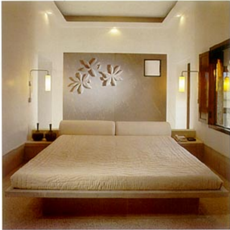
PALACE SUITE NO. 50