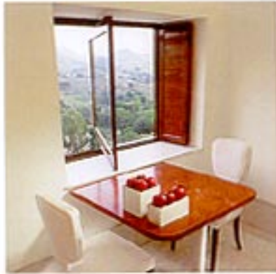
PALACE SUITE NO. 32