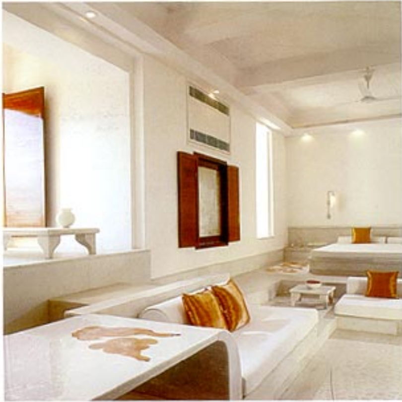
PALACE SUITE NO.33