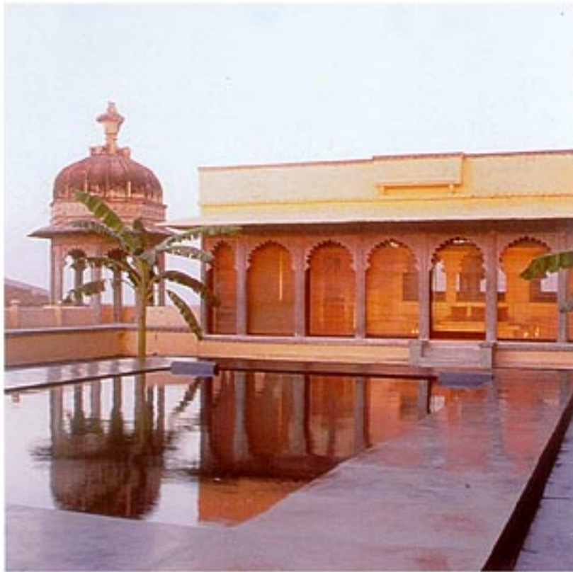
PRIVATE POOL OF THE DEVI GARH SUITE