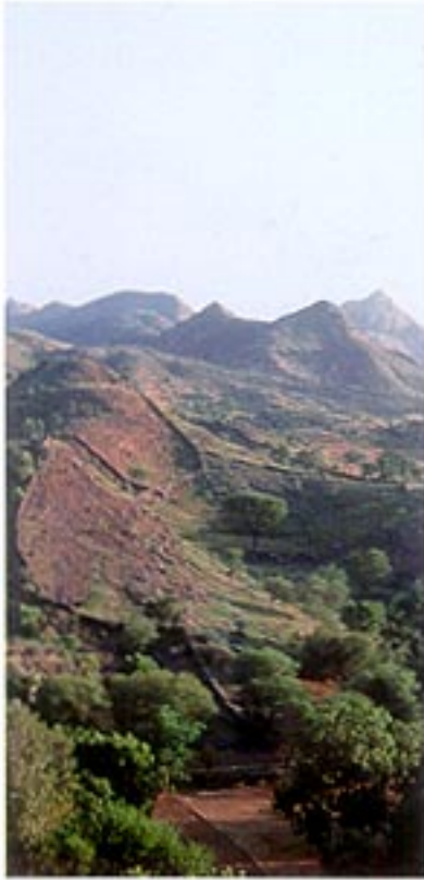
VIEW FROM PALACE SUITE NO. 41