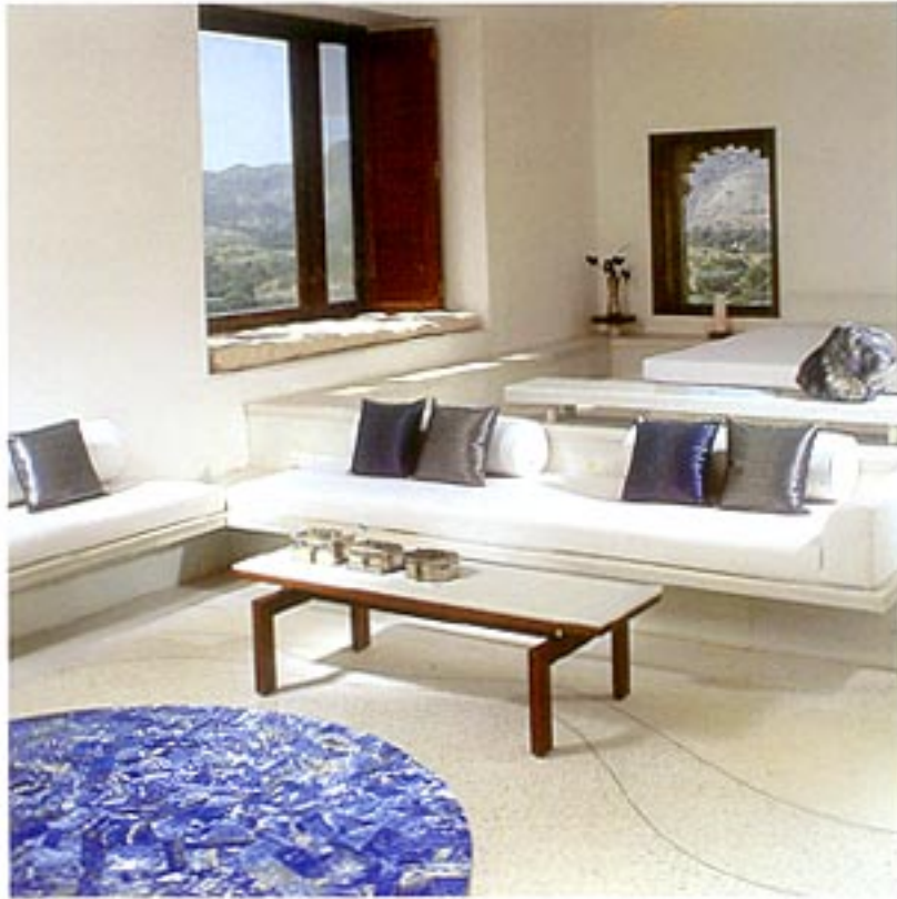
PALACE SUITE NO. 41