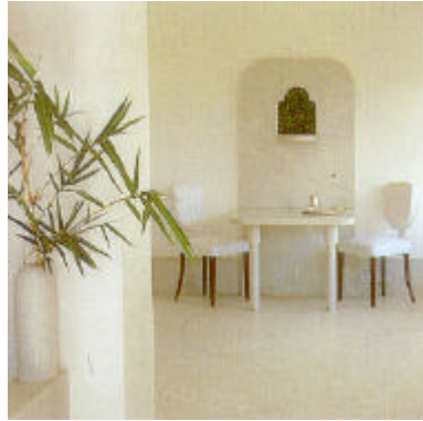
PALACE SUITE NO. 50