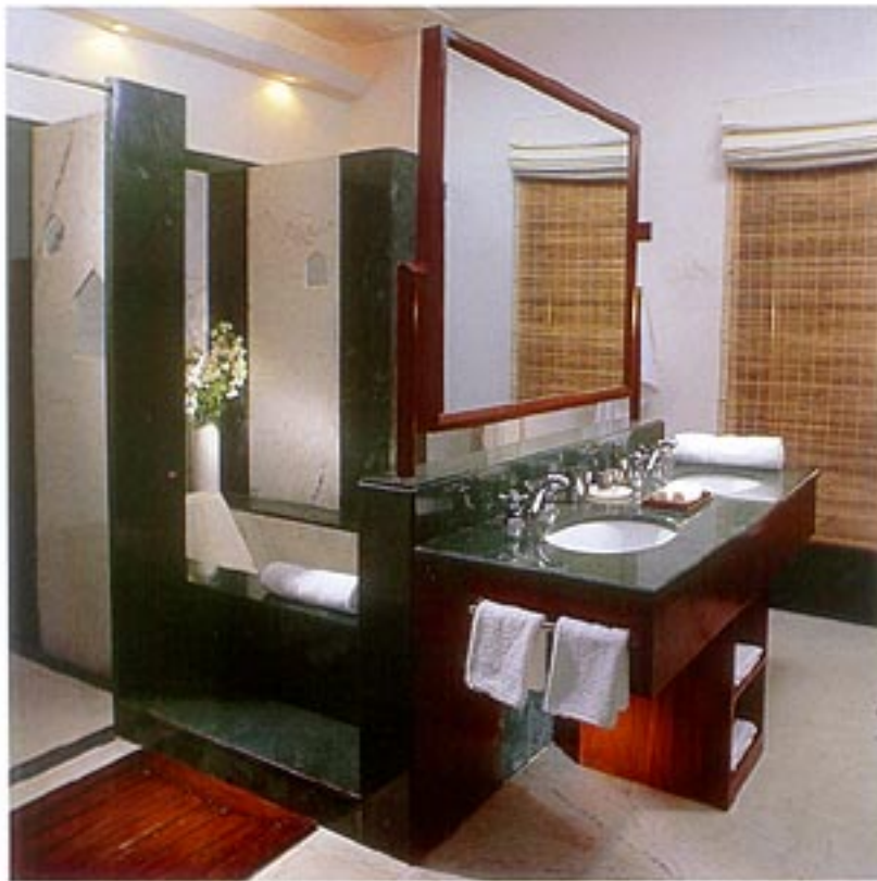
GARDEN SUITE BATHROOM