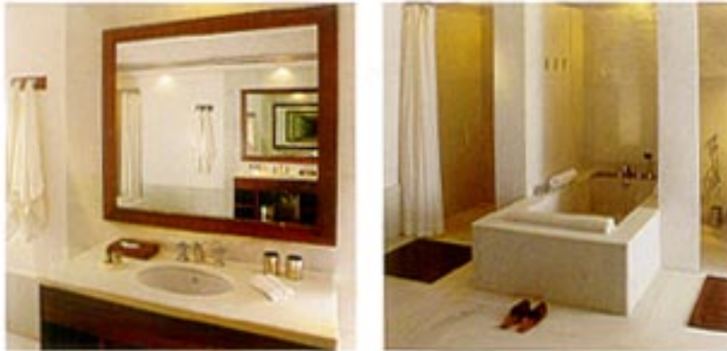
PALACE SUITE BATHROOM