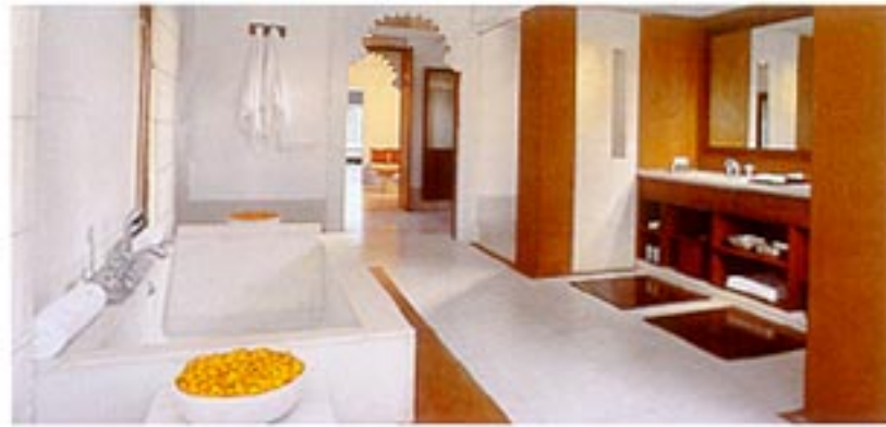
DEVI GARH SUITE