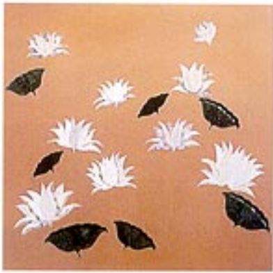
DUPLEX SUITE DETAILS