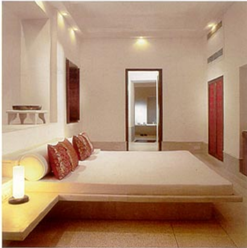
PALACE SUITE NO. 32